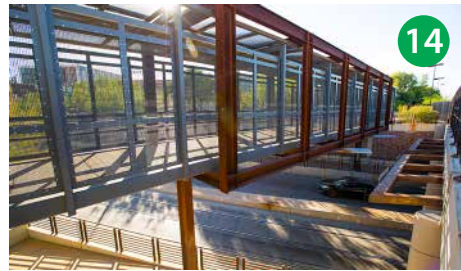
14 4th Ave Bridge & Underpass 4th Ave. & Congress St.