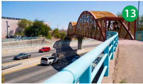
13 Basket Bridge Rosemary Apple Blossom Lonewolf, 2007 Euclid Ave. south of Broadway Blvd.