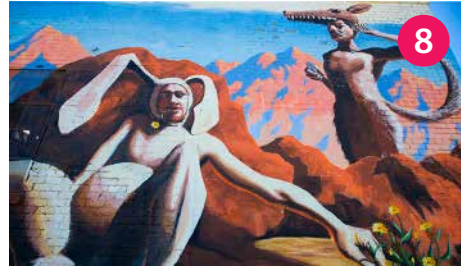
8 Borderlands Mural Joe Pagac 119 E. Toole Ave.