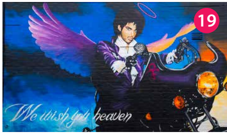
19 Prince Mural Joe Pagac Rialto Theatre, 318 E. Congress St.