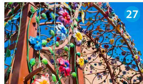
27 San Augustine Gazebo S. Stone Ave. & E. Corral St.