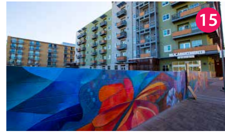
15 Interconnectivity mural Niki Glen N. 5th Ave. & N. Toole Ave.