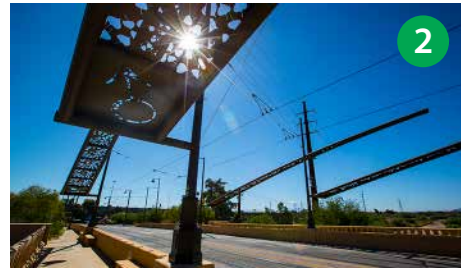
2 Luis G. Gutierrez Bridge Structural Grace Inc., 2014 Cushing Street