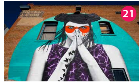
21 Vergiss Fin D.A.C 178 E. Broadway Blvd.