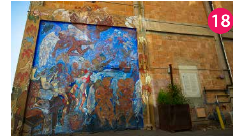
18 On the Wings of Music We Discover Salvation Salvador Duran Rialto Theatre, 318 E. Congress St.