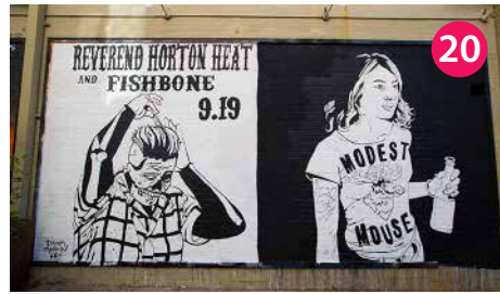
20 Rotating Mural Joe Pagac & others Rialto Theatre, 318 E. Congress St.