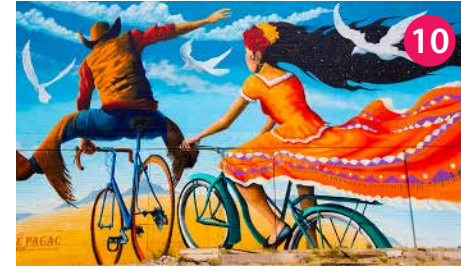
10 Epic Rides Bicycle Mural Joe Pagac, 2017 534 N. Stone Ave.