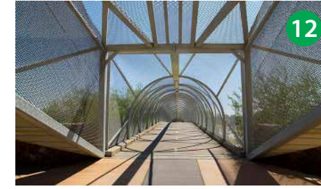
12 Diamondback Bridge Simon Donovan, 2002 Broadway Blvd. east of downtown