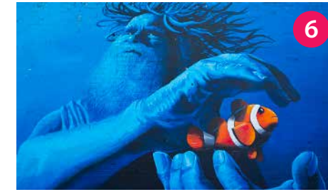
6 Harboring Beauty Mural Joe Pagac 191 E. Toole Ave.