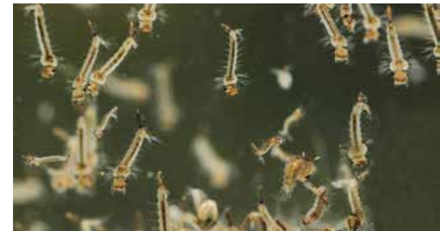
In just three days stagnant water becomes prime habitat for mosquitoes.

You can check for larvae and pupae yourself using a white cup. Dip the cup into the water and look for the 1/4 -3/8 inch-long wriggling larvae. Similar larvae that don't wriggle may be dragonfly larvae or other beneficial insect predators.