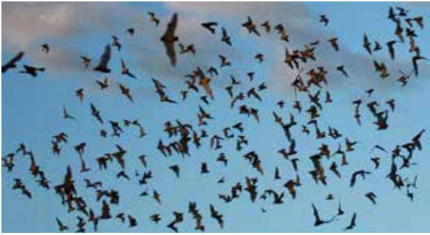
A healthy aquatic environment has many natural predators, such as bats, to control mosquitoes.