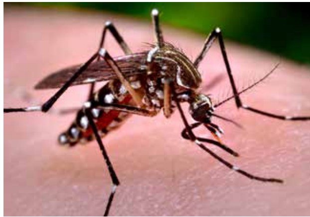
There are 150 different species of mosquitoes occurring in the United States and over 40 species in Arizona.