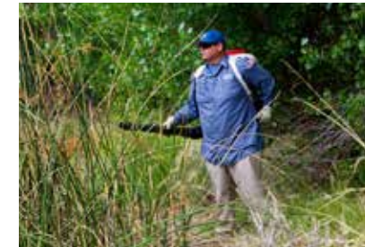
Crews broadcast Bti granules at Kino. All-natural Bti disrupts the breeding cycle of mosquitoes.