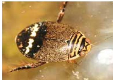
Mosquito larvae face many threats including Predacious Diving Beetles.

Don't add bleach or other chemicals to ponded water, as this creates conditions that can favor mosquito breeding.