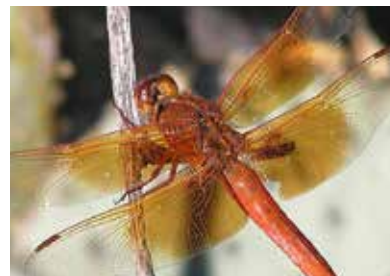
Dragonfly larvae eat mosquito larvae.

Pima County staff regularly removes nuisance ponding and vegetation where mosquitoes can breed.