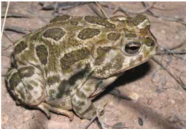
Wetlands provide valuable habitat for a variety of native species, including the Great Plains Toad.

The District and our partners routinely check for larvae, apply Bti and reduce shoreline vegetation that could harbor mosquito breeding.