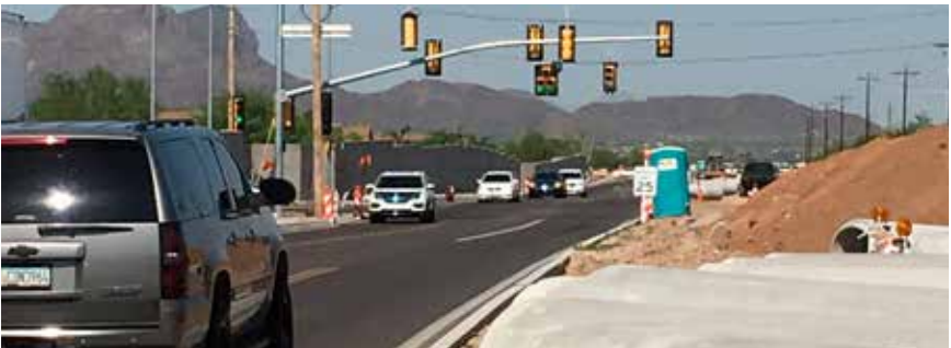
Highway User Revenue Funds (HURF) are funding the Cortaro Farms Road improvements.

While 1997 HURF revenue projects were originally planned for completion by Fiscal Year 2013/14, a lack of HURF revenues caused by the economic downturn, sweeps by the State Legislature and more fuel efficient vehicles, means that projects have taken longer to complete. For Fiscal Year 2017/18, HURF revenues to Pima County are projected to total approximately $61.6 million, and 40% are forecasted to repay debt for these transportation projects. Several projects are also reliant on Regional Transportation Authority (RTA) funding and scheduling. Three projects are managed by the City of Tucson.