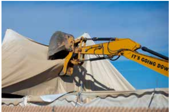
On June 29, 2018 the temporary dog housing tent, erected in 2014, was removed along with two modular buildings. These three structures were integral in allowing the Pima Animal Care Center to provide the necessary services until the new facility was completed. Their removal marks a new era in animal related services to the people and companion animals of Pima County.

Improvements to Town of Ajo Pima Animal Care Facility.