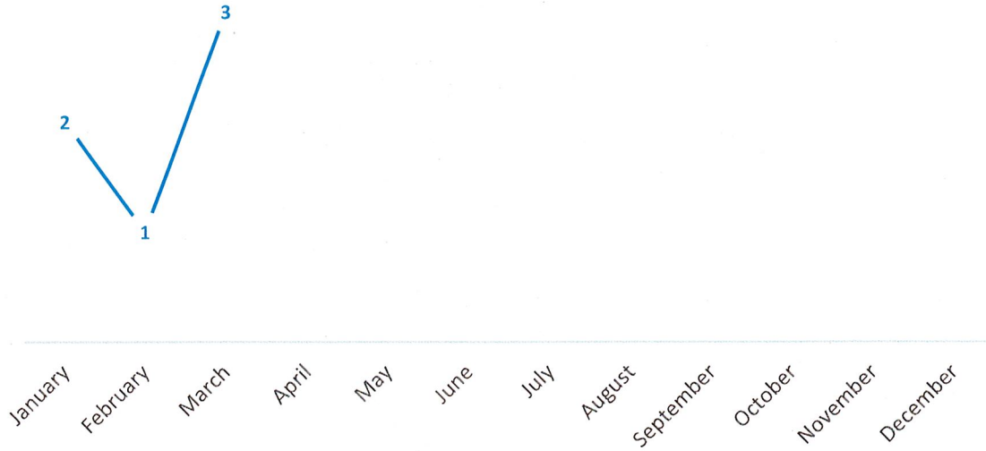
FIGURE 12 (F12)