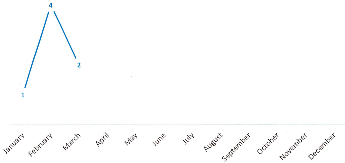
FIGURE 8 (F8)