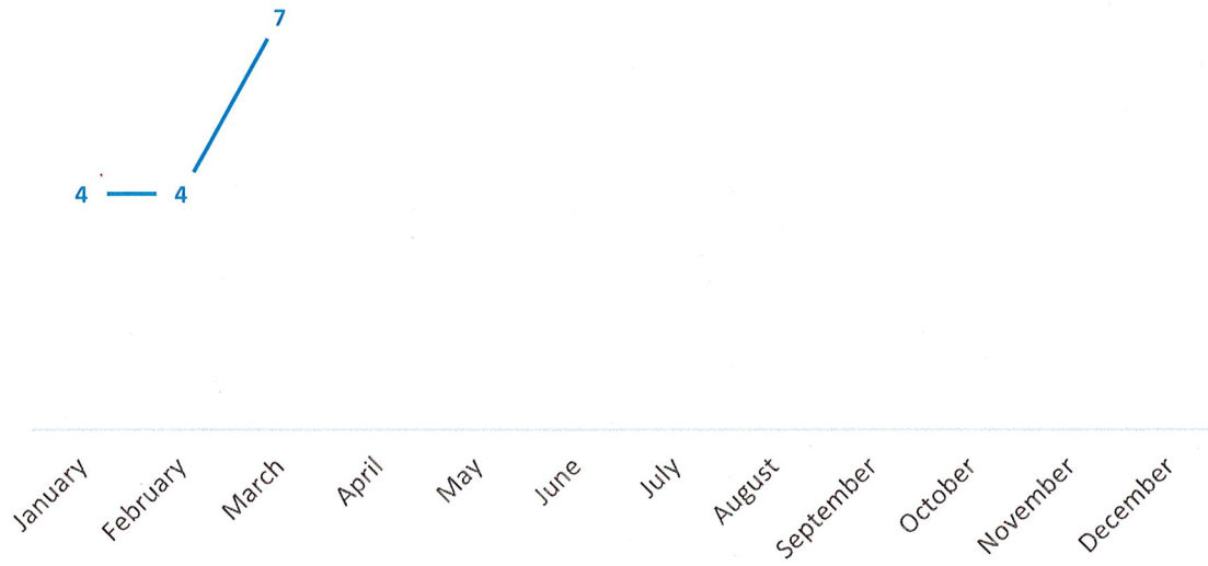
FIGURE 6 (F6)